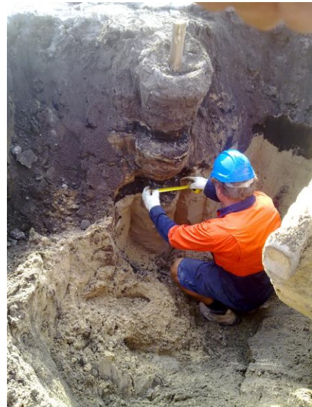
Exhumed test pile where pressure and flow rates were adjusted to determine the change in pile diameter