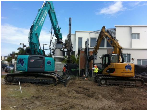
Two drill rigs were used. One was used to install the grout columns while the other installed the 6m long universal beams