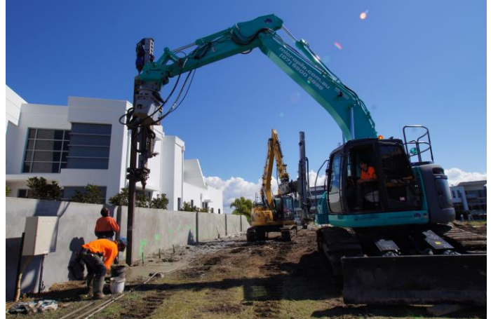
Installing the 6m long universal beam