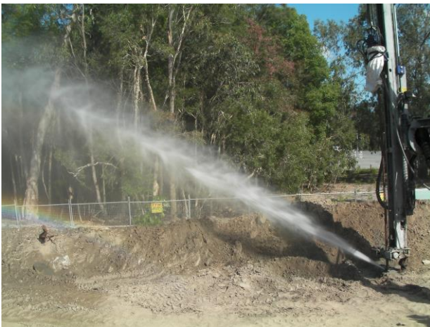
High pressure grouting was used to increase pile diameters to 400mm.